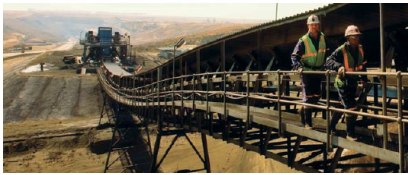
Sasol Annual Report 2010, page 29.